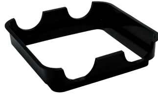
1x Strawberry Topper